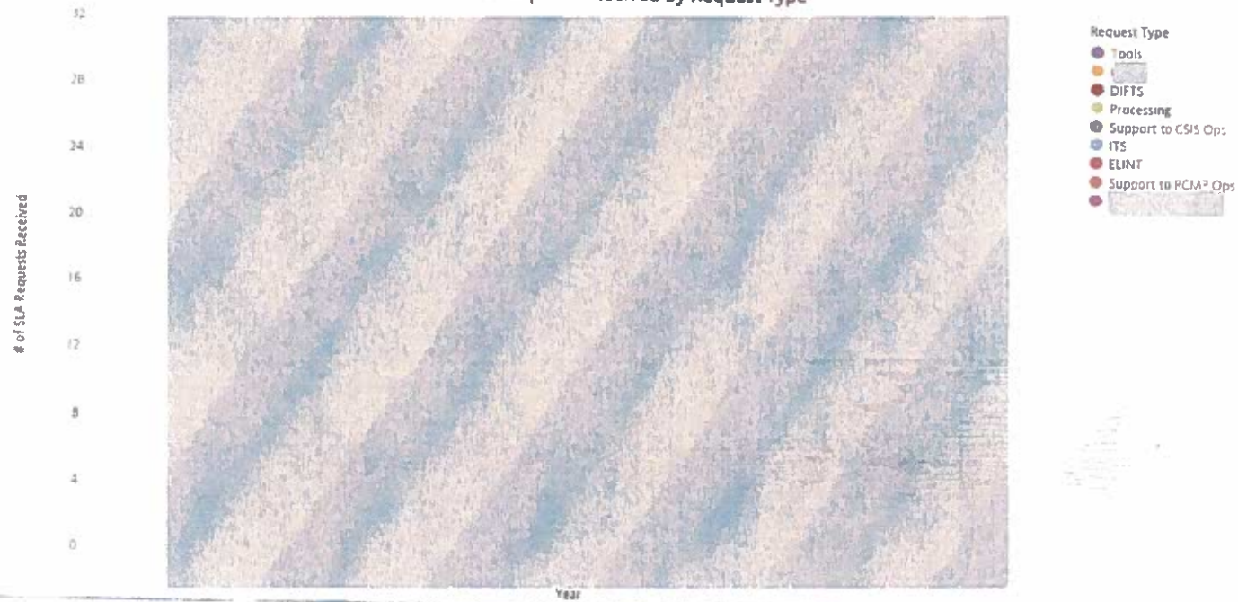
SLA Requests Received by Request Type

SLA Requests Received between: 1-Jan-09 12:00 AM and 31-Dec-12 12:00 AM